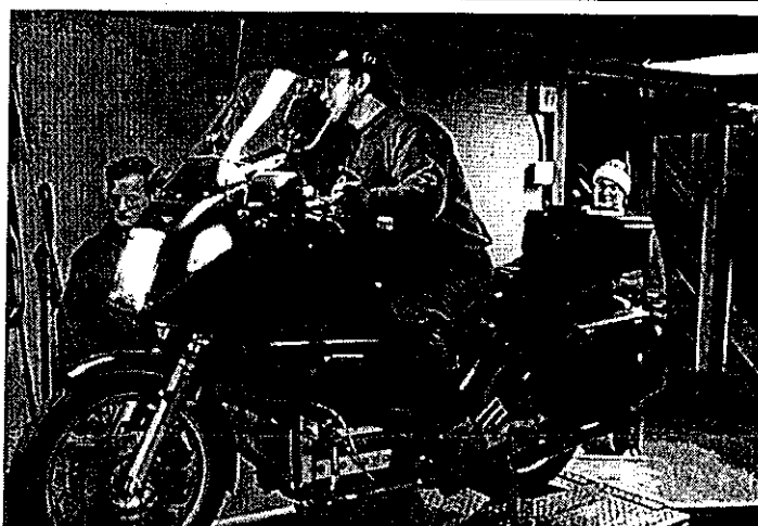
January Tech Session - See Inside!