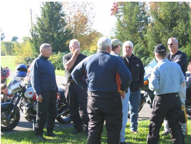
Some Shore Riders

No accurate count was made, but the number of Shore Riders was about 35. This made us the 'winning' club. We had more riders than either Skylands or New Sweden.