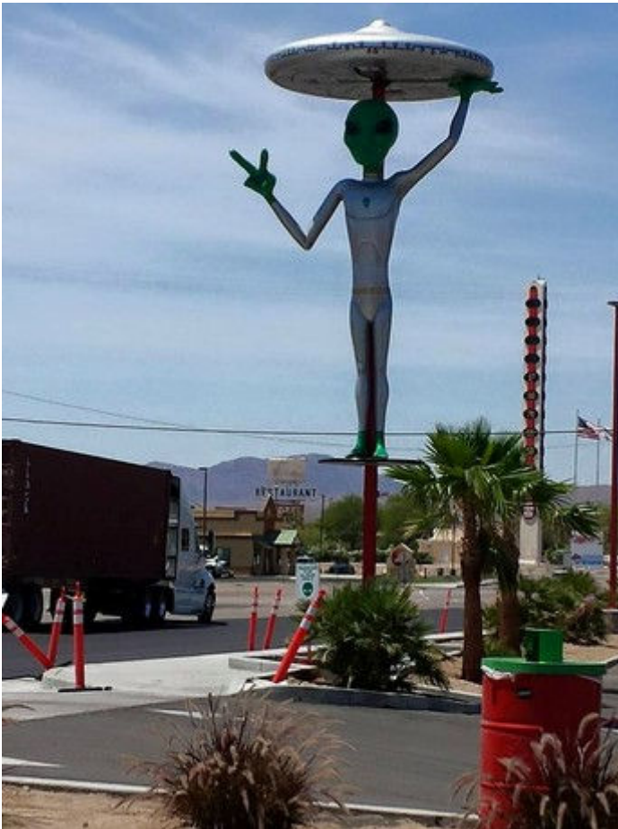
Alien Fresh Jerky

So on the road at 9:30, Doofus predicted I'd be in Barstow by 12.30PM. Well its 1PM and I'm almost there. About another 10 miles. And that's where I'll hide from the heat until tomorrow at the crack of dawn..