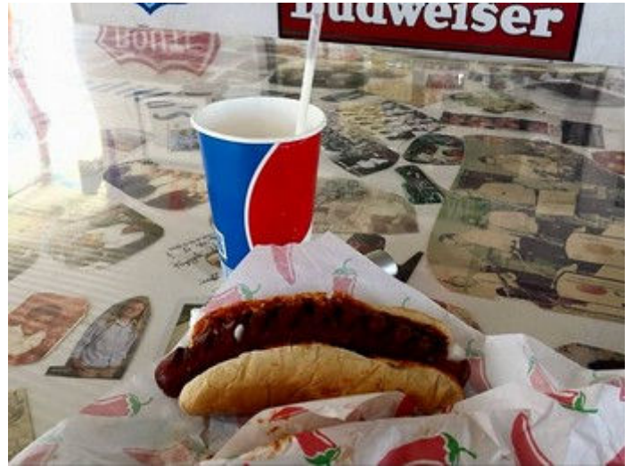
Chilli dog with onions and cheese.

Oh, where was I standing in line? Delgadillos shake shop. The owner is most kindly described as eccentric. Or crazy smart.