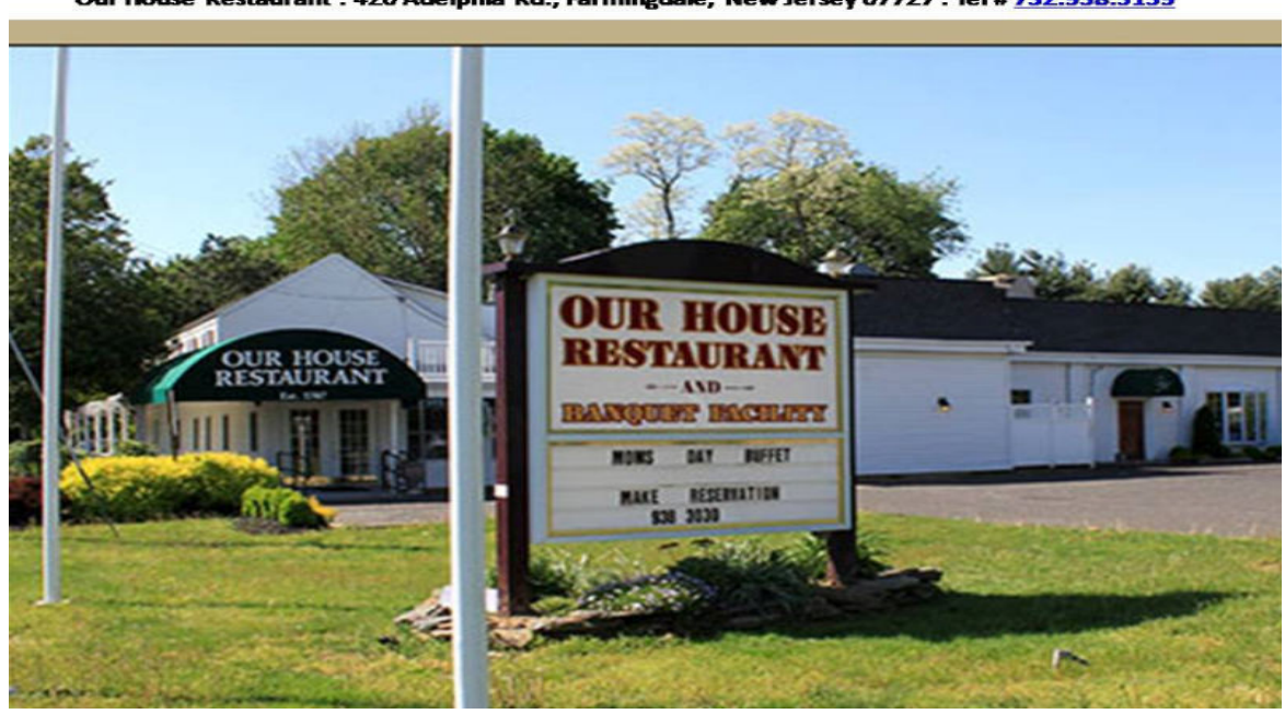
Eat @ 6PM Business meeting starts at 7:30PM

Our House Restaurant: 420 Adelphia Rd., Farmingdale, New Jersey 07727. Tel # 732.938.5159