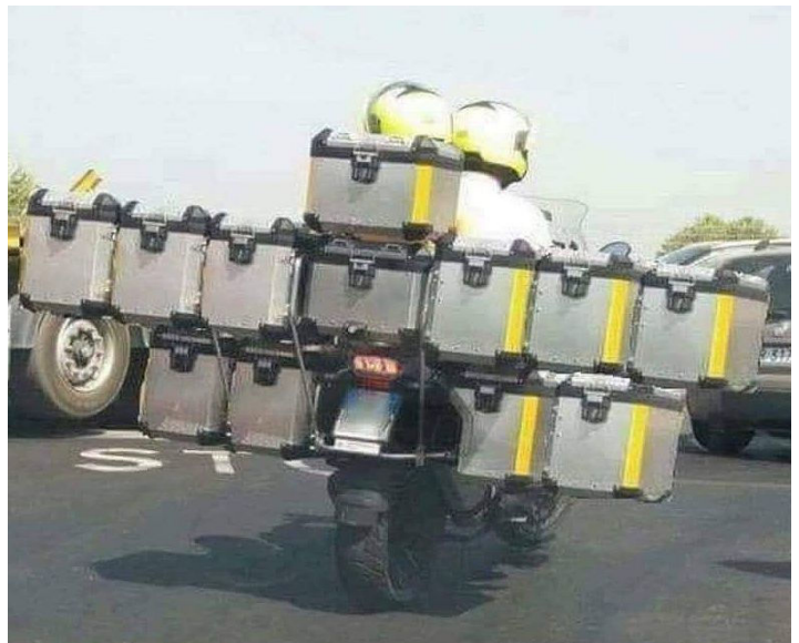
Roger's bike AFTER the flea-market

Attendees love the flea market and bring huge amounts of gear&parts. My great buy was an almost new Nolan helmet for $70 that I needed to replace a 5-yr old loose-fitting one. A year ago I implemented a "Free Box" where anyone can throw old/low value items if they don't want to take them home. Not to my surprise, BMW guys will take anything for free. I rid myself of an old-old helmet and a 10yr old blue-tooth system (couldn't sell it for last 2 yrs in the flea market.) Even old worn-out boots disappear from the free box.