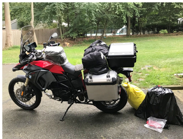
Roger's bike before the flea market

then North on PA Rt 33, I-80, I-380, I-81 with our first stop at a little-known candy outlet near Scranton. Gertrude Hawks has a "seconds" store next to their factory/distribution center. You can fill a couple large bags of carbohydrates & calories for $15. My fellow Finger Lakers love (and expect) these treats. So far on the first day, weather was great.