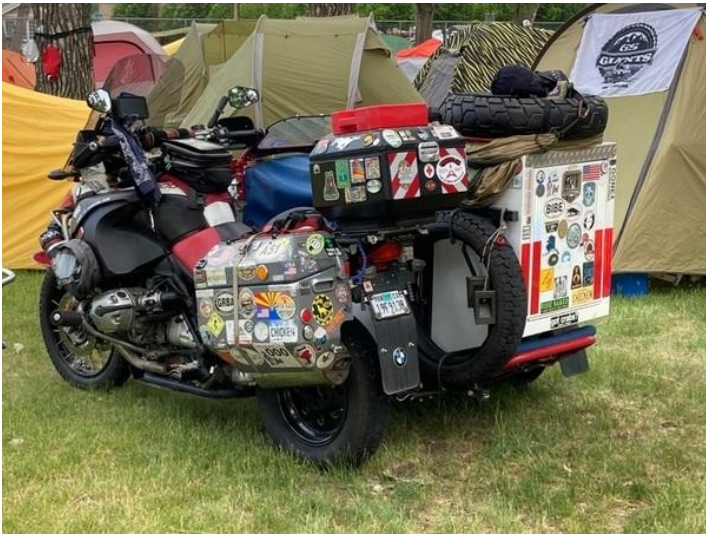
Well traveled (or at least well-stickered) sidecar rig at the MOA National.