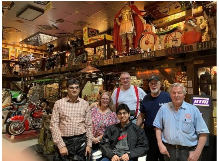
At Bill's Cycle Barn.