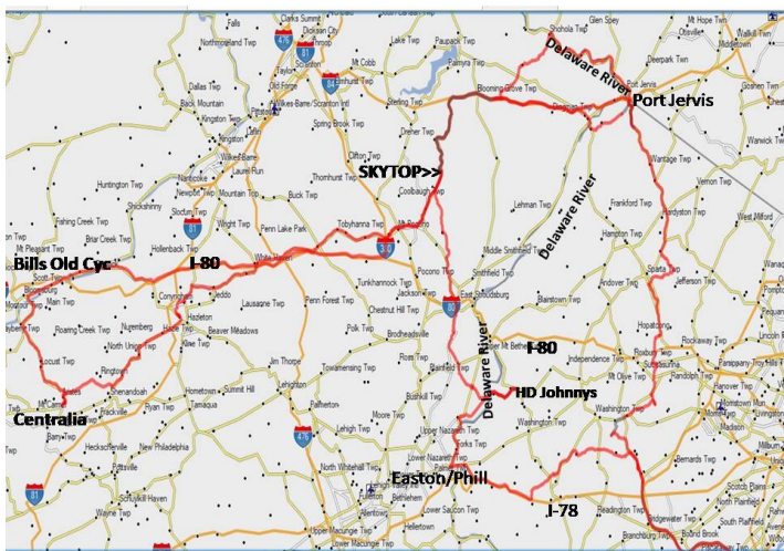
Rally Route Map