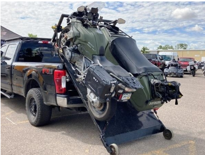
Both the rig and the loading mechanism are interesting. MOA National.