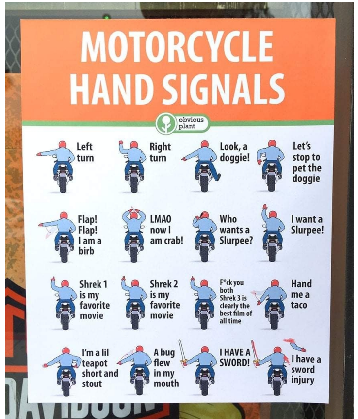
Some useful hand signals for group rides.

Your advertising message here! Contact editor@njsbmwr.org