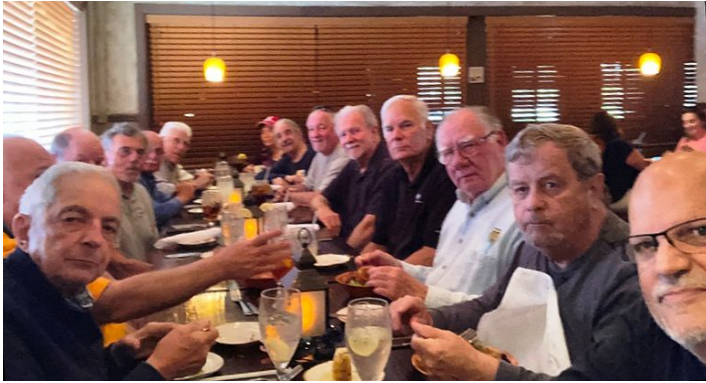
Yet another Moribundi