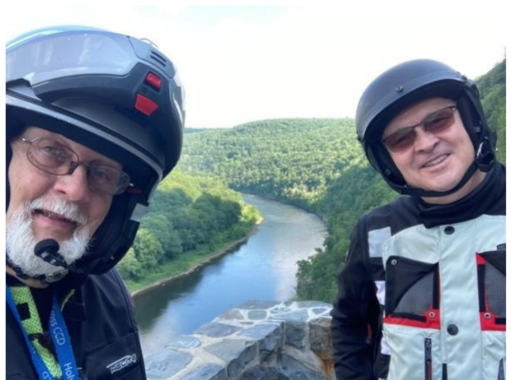
Our heroes at Hawk's Nest overlook. Why are their heads crooked?