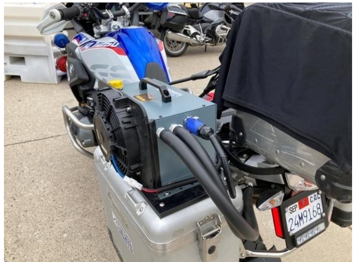
Air conditioner?