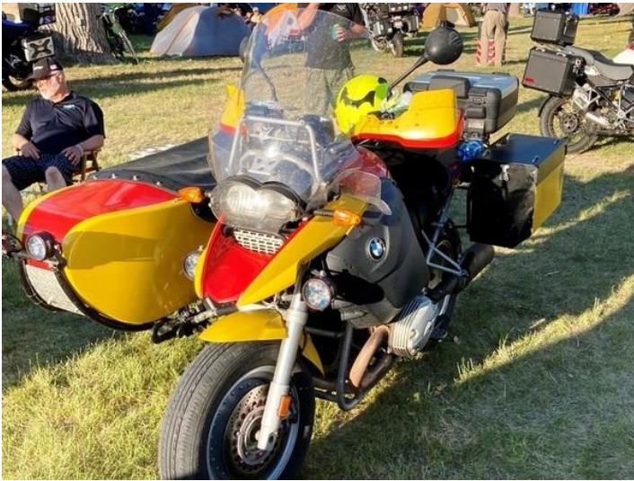
Colorful sidecar rig at the MOA National