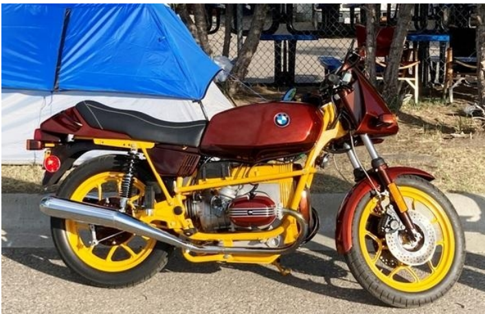
Crazy paint job on an R65LS(?) at MOA National