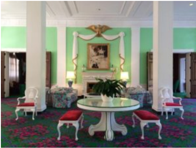
The Greenbrier Hotel lobby., Who would have thought that the government housed a secret bunker underneath?

tive, the door was hidden behind a screen that made it look like it was part of the wall.