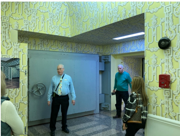
For three decades that the bunker was ac-