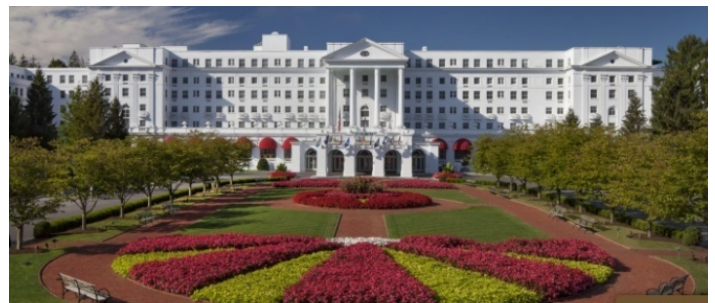
Front view of magnificent Greenbrier Resorts. The resort consists of several buildings, cottages, golf courses, etc. See https://greenbrier.com/ . It is located 63 miles from I-81 (Lexington VA) West on I-64.

The site, the tour and WV riding locations are well worth while. Our tour guide was very knowledgeable and continuously kept us interested and answered all questions. (He couldn't tell us where the President and Vice President would be taken in an emergency.) There was never any hard-sell on anything. White Sulfur Springs is located near some great riding roads... paved and unpaved. If I went again, I would spend a couple days riding the area. We stayed at the Q-Inn located about 12 miles away... because $450 to $2500 per night at The Greenbrier was a bit too much.