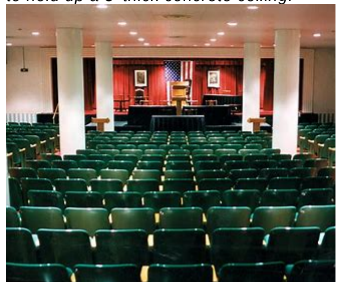
One of several Congress meeting rooms.