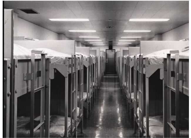
Typical living quarters for "Congress."

tive, the door was hidden behind a screen that made it look like it was part of the wall.