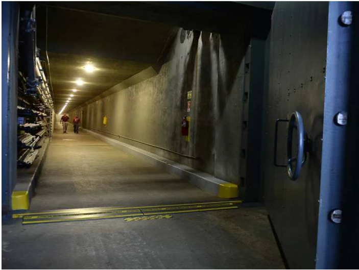
Another access door between truck terminal and inside bunker