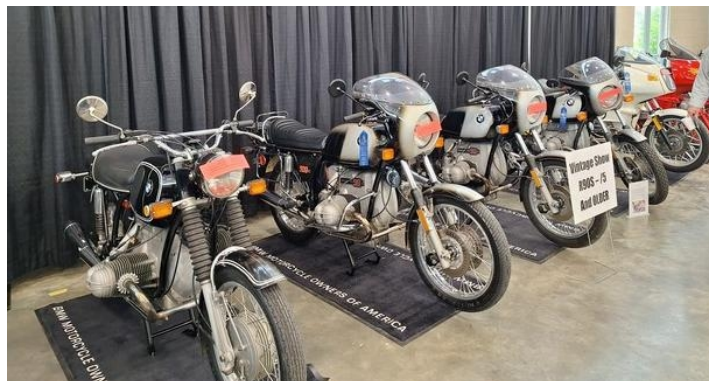
(part of) The official vintage bike show.

No BMW National would be complete without the awards for long distance male, oldest pillion, etc.