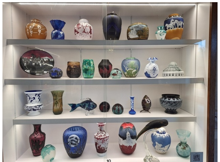
Glass and ceramics at the Huntington Museum of Art