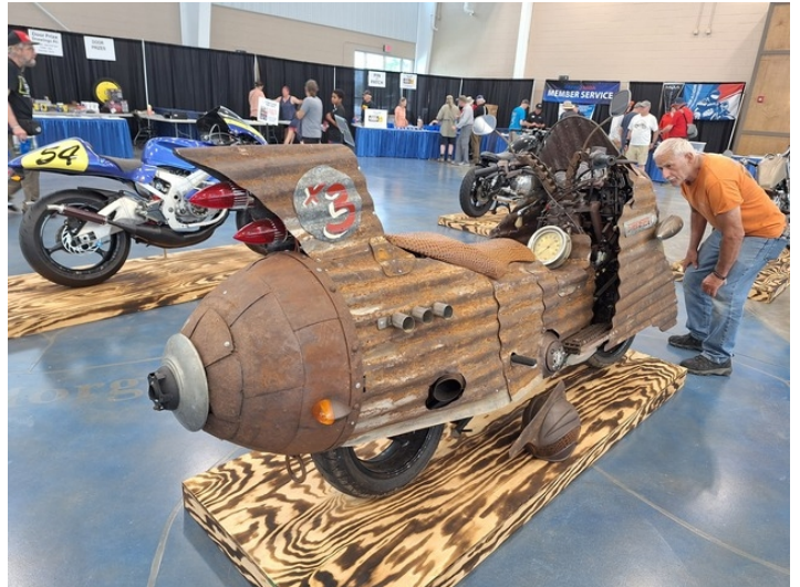
Clearly, the most off-the-wall custom in the custom bike show. Note the matching helmet.