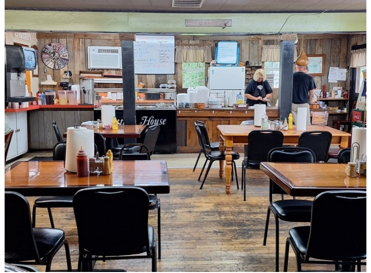
Ritter House: Those two white boards are the menu and the specials.

One of the things I like about long trips across the country is visiting local eateries. This place was a real gem – The Ritter House, in Glasgow, KY. From the name, I was worried it was going to be expensive – I couldn't have been more wrong. It's a tiny local restaurant that has a very limited number of dishes each day, mismatched furniture, and low prices.