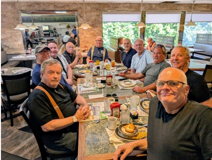
An especially well attended club breakfast at the Princess Maria on June 21.