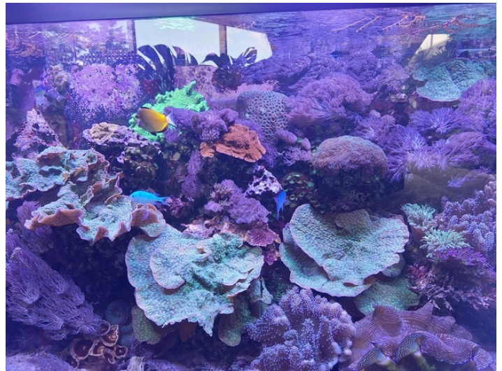
An aquarium at the Huntington Museum of Art.