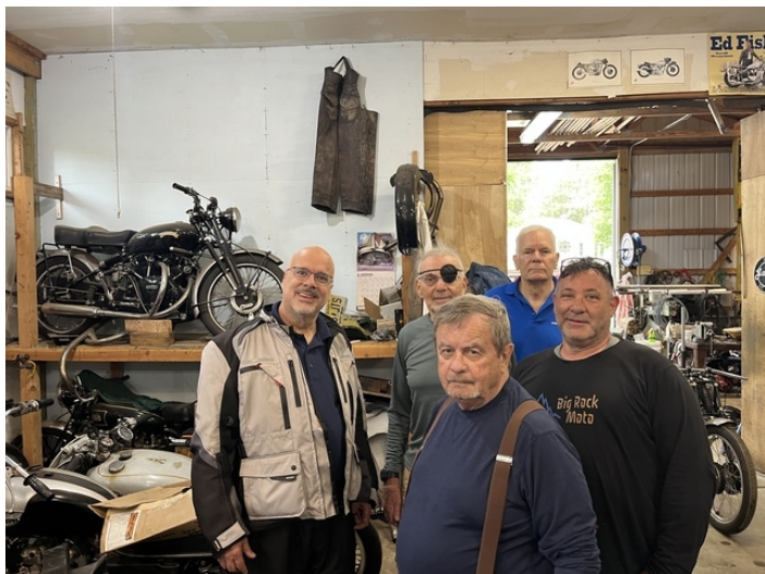
Some of the attendees.