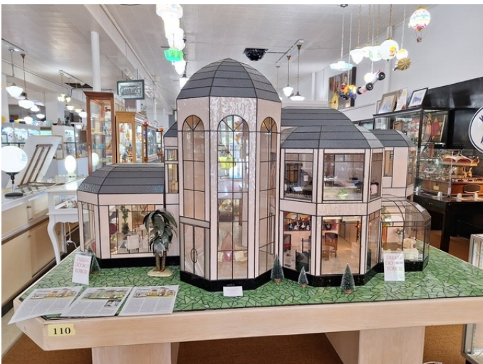
A glass doll house at the Museum of American Glass in West Virginia.