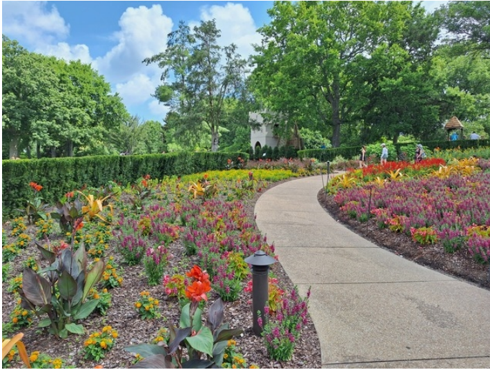
A tiny part of Cheekwood Gardens.

was ok, but it cost money and we didn't have a lot of time to spend there.