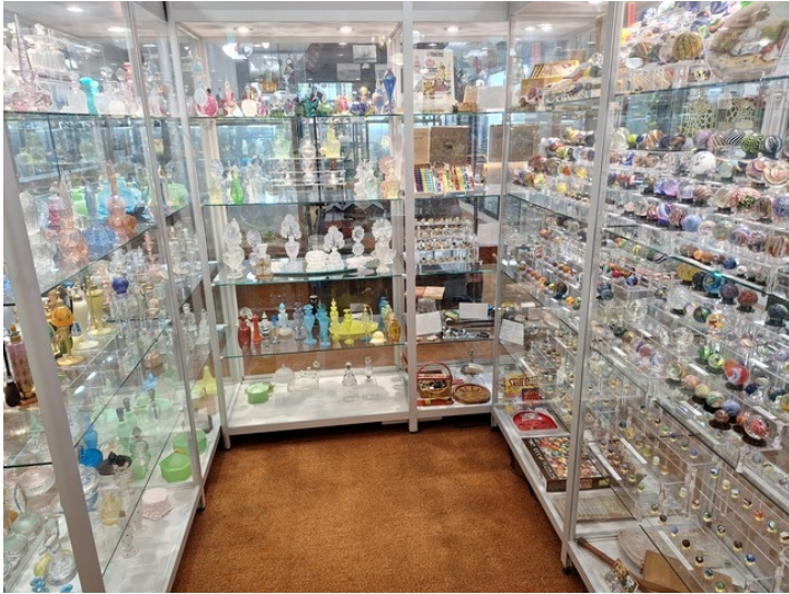
The museum's collection is encyclopedic in scope

On every trip, we try to do something besides burn gasoline, and on this trip, we visited a number of interesting places. First mention is the Museum of American Glass of West Virginia, which is free and has a collection with huge breadth. Unlike the Corning Glass Museum in Corning, NY, this museum includes more plebian items, like canning jars. Recommended.