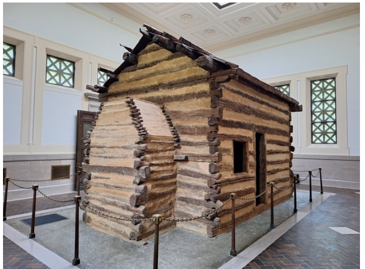
A replica of the cabin Lincoln was born in.

because the parking attendant suggested we park on the sidewalk perimeter of the parking lot, and I liked that better anyway, since the sidewalk was concrete so no danger of my side stand sinking into the asphalt.