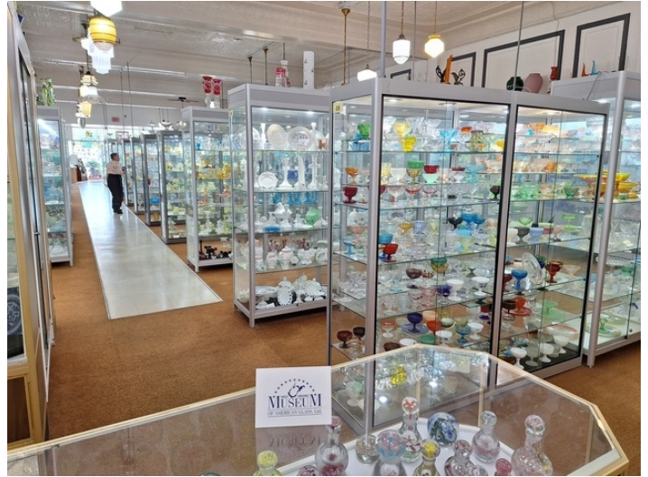
My eyes glazed over at the size of the collection.