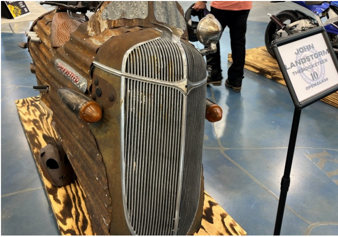
Front end of this very custom bike... or car... or ????