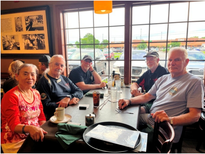
Dinner at an Italian Restaurant.... Good food and walking distance to our hotel.