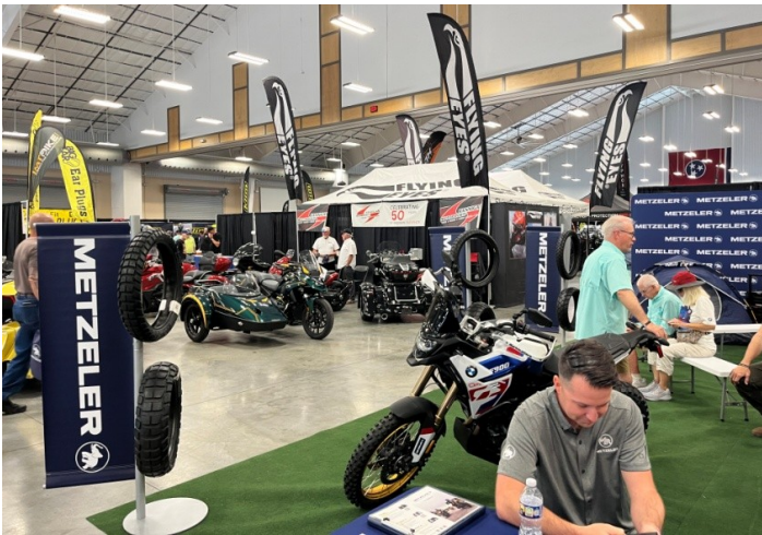
Vendor displays... over 100 vendors attended as well as BMW Motorrad MC truck.