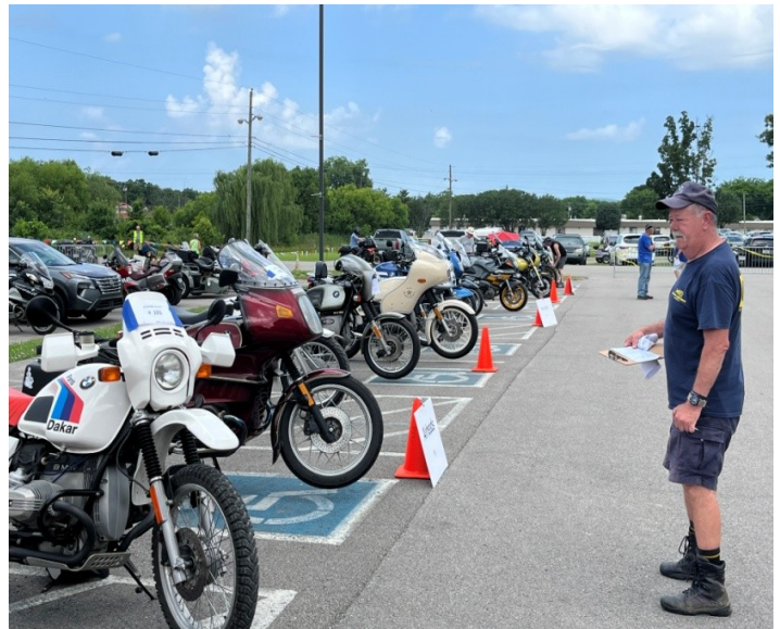
Shown are only some of the Bikes that were part of PCBJ event. These bikes were in the Air Head Class. The closest one, white R100GS won 1 st place for Air Heads. Also shown is one voter with paper&pencil in hand.