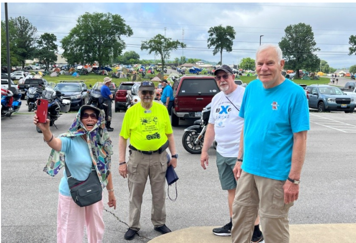
Checking out our PCBJ intended event site. It was hot.