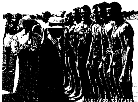
Queen Elizabeth reviewing the.. umm..