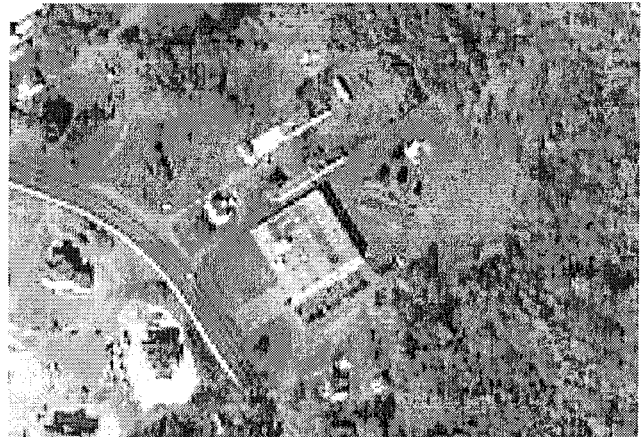
Aerial shot of our rally site

Farmingdale NJ, and the Deserted Village at Allaire State Park)