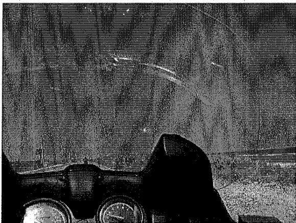
Up early for morning rides along the beach in Flagler.

While it's only January...it is time to think about the March Daytona experience. If you haven't been, check out the '06 photo log of a typical day.