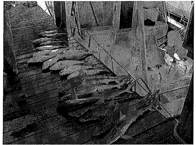
Results of mid-day fishing off Ponce Inlet.

Of course the main reason for the event was to support the hospice in Newton where Karen Ann Quinlan resided in a coma for 10 years.