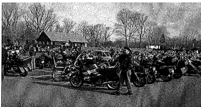
Lots of bikes, no club members I could find..

Since I couldn't rouse anyone to go with me, I went by myself to the annual toy-run Polar Bear event at the Cabin in Howell. I saw no club members while I was there. I saw a few Skylands members.