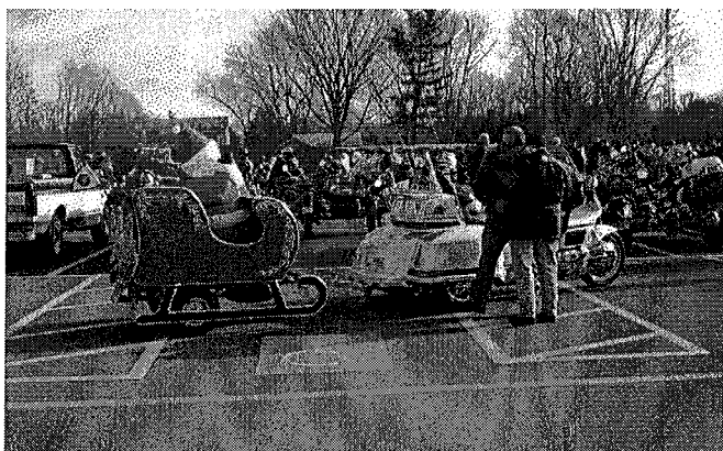
Santa arrived in a sled towed by a Goldwing