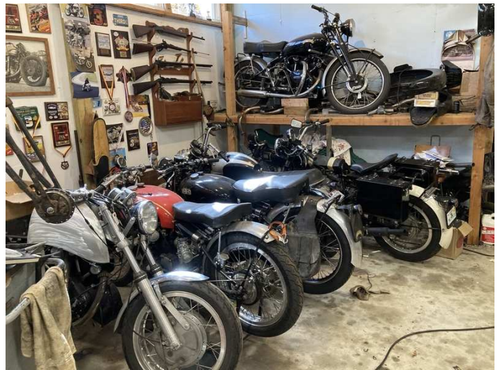
That there's a row of Vincents.