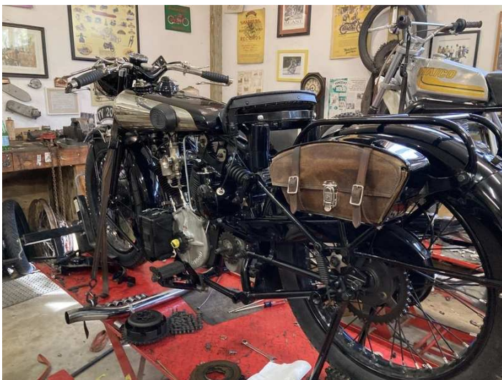
Brough Superior SS100