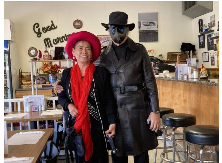
meanwhile, at the Breakfast Club . . .