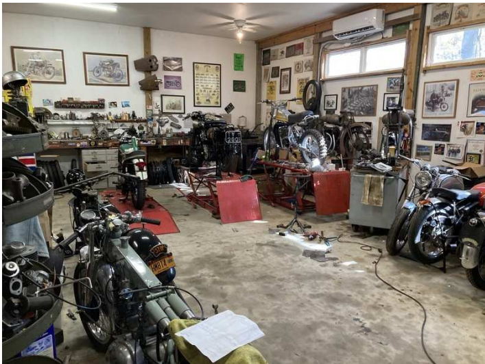
this is about 1/4 of the entire shop