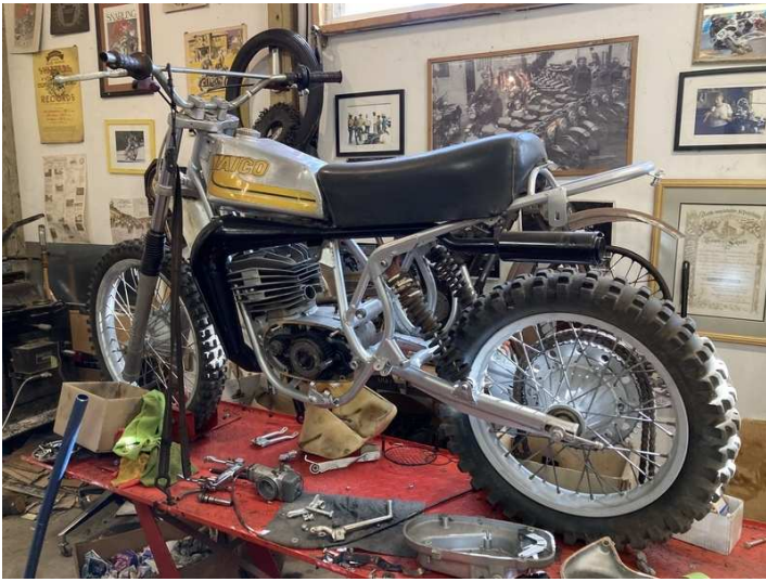
Maico dirt bike

had a table outdoors, for the place is small and crowded. Good thing we were wearing all that nice warm motorcycle gear.