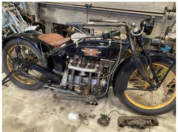
Henderson/Excelsior inline 4 cylinder